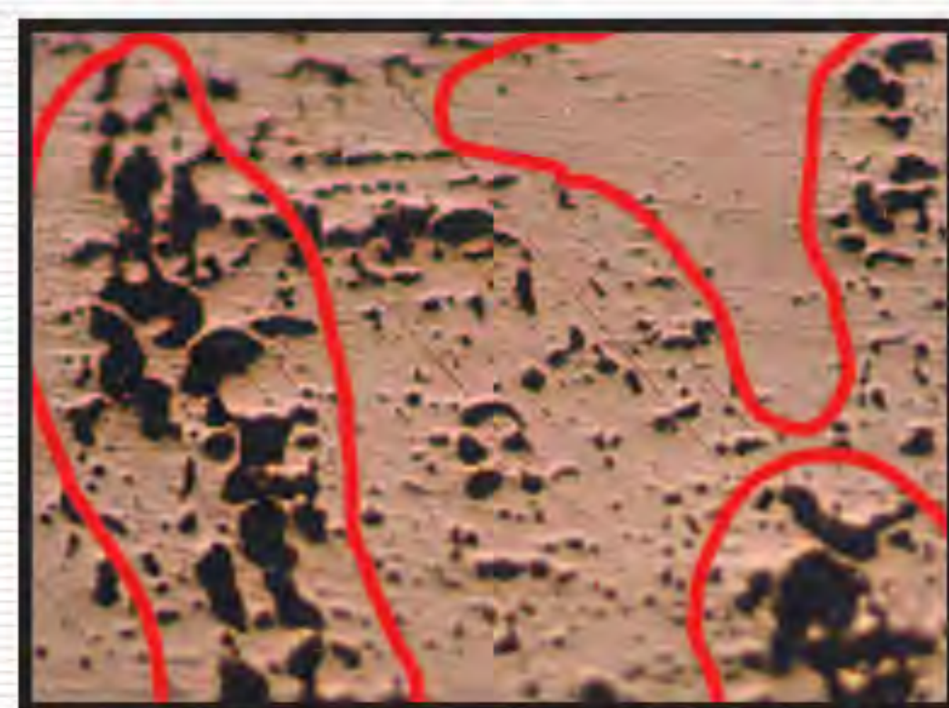
Gold melted with conventional method.